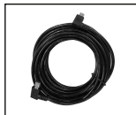
Rear Cam Connecting Cable