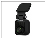
Rear Digital Video Recorder