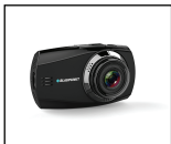
Front Digital Video Recorder